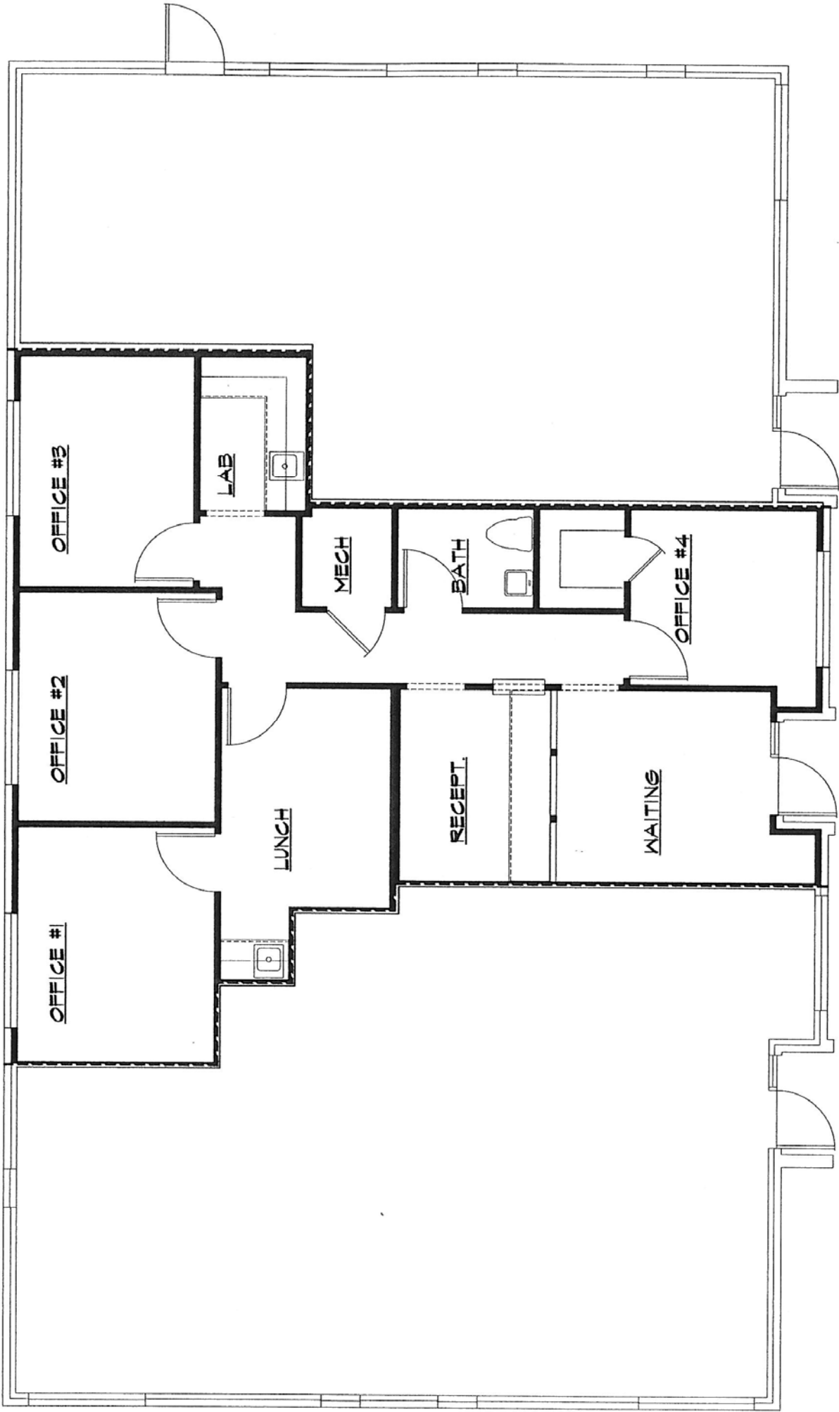
Suite B - 1078 S.F.